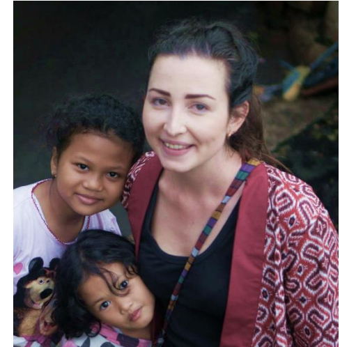
Euan Crone Asian Awareness Scholarship

Their article, " The politics of repressing environmentalists as agents of foreign influence " was awarded for its originality and innovation. It is likely to have extensive impact and broad applicability to international issues. The article can be found in AJIA Volume 72, Issue 2, 2018.