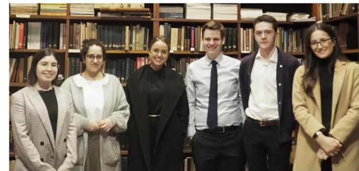
AIIA New South Wales interns 2018-2019