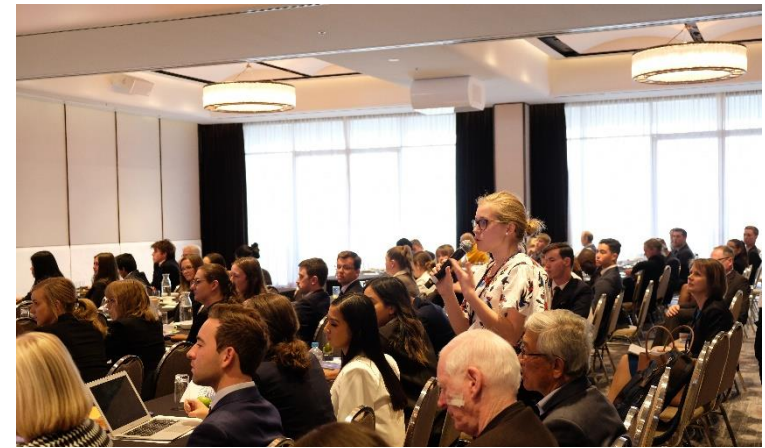
Q&A session at the 2018 AIIA National Conference.

According to the Think Tank and Civil Societies Program's 2018 report, there were 8,248 think tanks in the world last year, including 42 in Australia. In recognition of its achievements, the AIIA was voted the highest ranked Australian think tank coming in at 56 in the world.