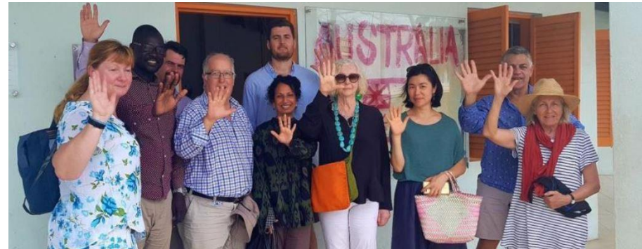
The AIIA Victoria 2018 Timor-Leste Study Tour group at Australia House in Balibó.

A total of 27 delegates travelled to Indonesia in June 2019 with the aim of establishing long term relationships with Institutions and to explore the extent of Australia's involvement in Indonesia at the Government, Educational, non for profit and business levels. The study group were determined to understand the gaps in Australia's relationship with Indonesia and explore the nature of the Indonesian Economy, its Body Politic, its Social and Religious cohesion as well as its views of Australia. The study tour resulted in the delegates feeling optimistic about Indonesia's future as they marvelled at the opportunities it has and the challenges it faces.