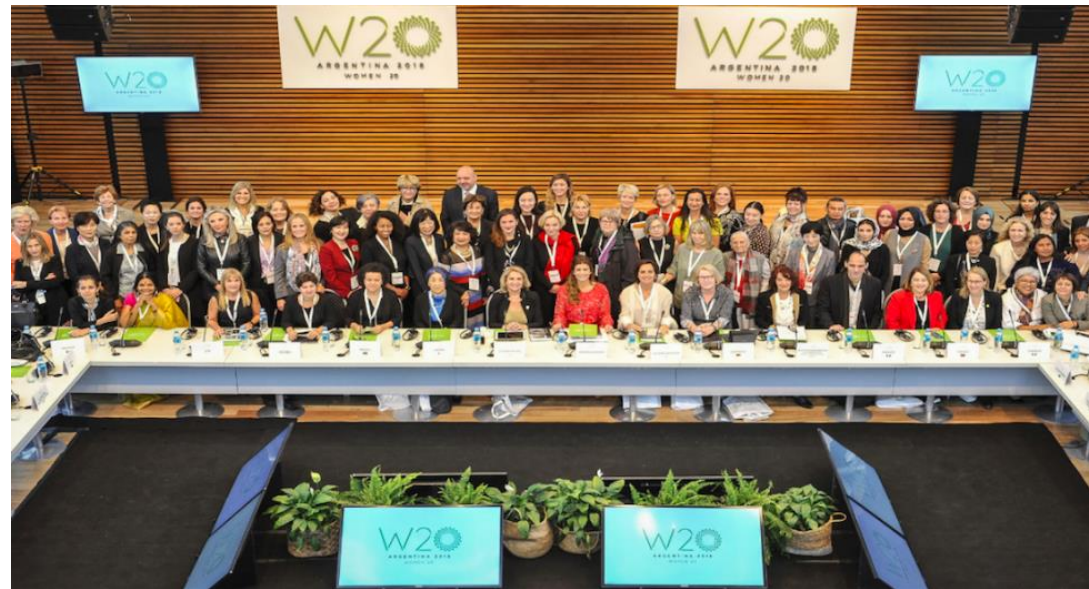
Women20 Summit 2018 – a transnational network that brings together female leaders to help increase women's participation in their economies and societies.

In partnership with the Korea Foundation, the third iteration of this forum was held in Melbourne. Early to mid-career academics and professionals from Australia and New Zealand met with a delegation of senior Korean academics to discuss summit diplomacy, China's rise and regional interests.