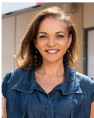
Dr Anne Aly MP