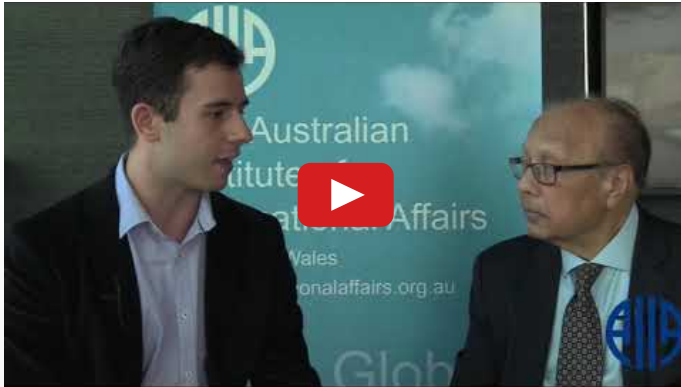
Ambassador Anwarul Chowdhury, former permanent representative of Bangladesh to the United Nations and UN Under-Secretary-General