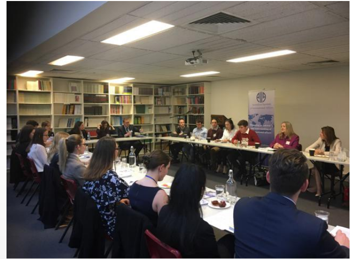
The AIAA held a roundtable with Global Voices delegates