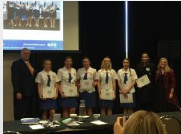
2017 Young Diplomats Program winners from Pimlico State High School.

In 2017 the AIIA continued its long-term partnership with James Cook University to run a diplomacy competition for Year 10 students from the Townsville region in North Queensland. Winners were given the opportunity to attend the AIIA National Conference.