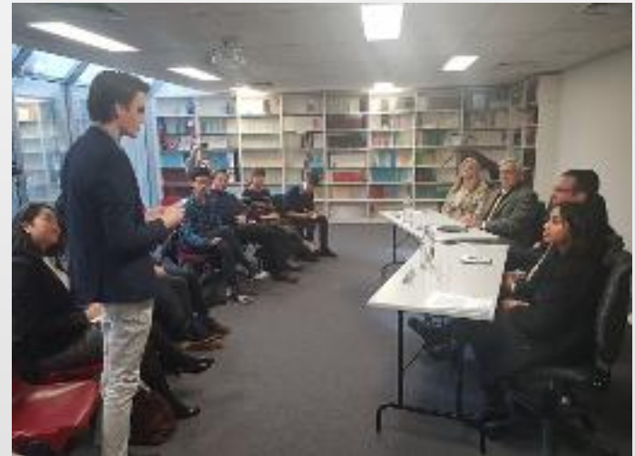
AIAA supported students from the International Alliance of Research Universities at the ANU Global Summer School

Australian Institute of International Affairs