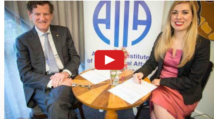
The Hon Robert French AC, former Chief Justice of the High Court of Australia, spoke at the AIIA for WA