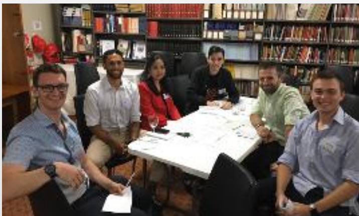
AIIA VIC Young Professionals Forum, March 2018