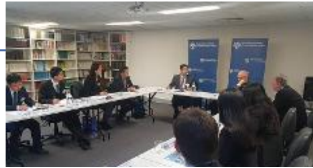
China Institute of International Studies roundtable

Senior personnel visited the South African Institute of International Affairs and Royal United Services Institute in London.