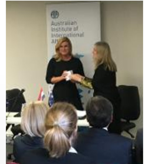
President of Croatia Her Excellency Kolinda Grabar-Kitarović spoke at AIIA ACT Branch

Throughout the year, thousands of AIIA members and members of the public took part in AIIA events. From the largest-yet National Conference to the EU-Australia Leadership Forum, annual dinners and addresses by leading diplomats, academics and analysts, 2017-18 was an outstanding year for AIIA events.