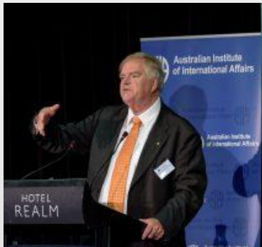
The Hon Kim Beazley AC FAIIA, AIIA National President