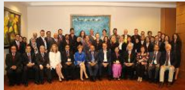
ASEAN-Australia New Zealand Dialogue, Kuala Lumpur, 2017