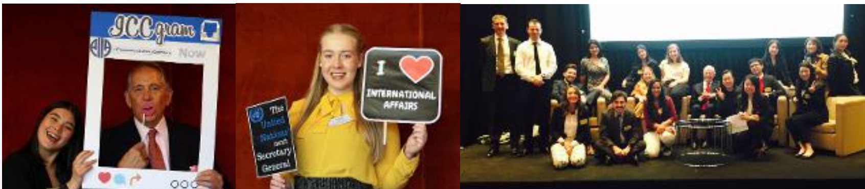
AIIA VIC International Careers Conference, August 2017