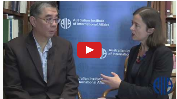
Ambassador Ong Keng Yong, ASEAN Secretary-General 2003-2008 and ambassador-at-large with the Singapore Ministry of Foreign Affairs