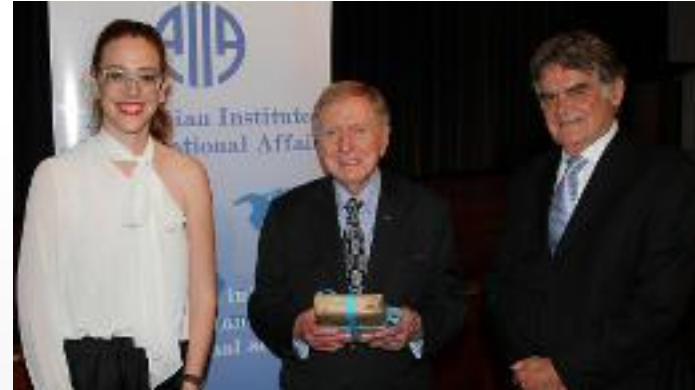
The Hon Michael Kirby AC CMG FAIIA spoke at AIIA Queensland's Annual Dinner in 2017