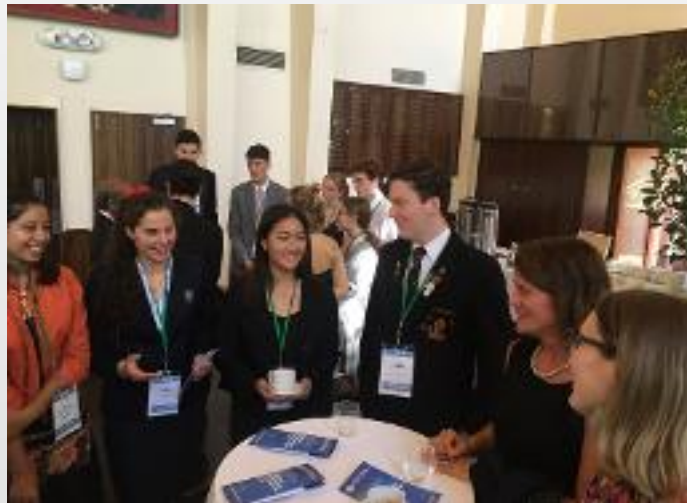
The AIAA hosted a diplomatic reception with UN Youth and members of the diplomatic corps