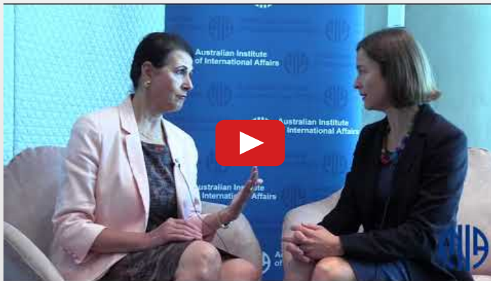
Senator Concetta Fierravanti-Wells, Minister for International Development and the Pacific, attended the 4th Indonesia-Australia Dialogue