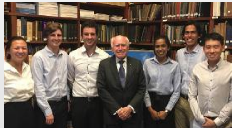
The Hon John Howard OM AC, Former Prime Minister of Australia, spoke to AIIA NSW and met with AIIA NSW interns

Australian Institute of International Affairs