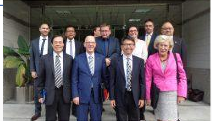
AIIA Delegation to Taiwan, April 2018

The visit included meetings with Minister of Foreign Affairs Dr Jaushieh Joseph Wu, the Taiwan ASEAN Studies Centre, National Taiwan University and the Prospect Foundation