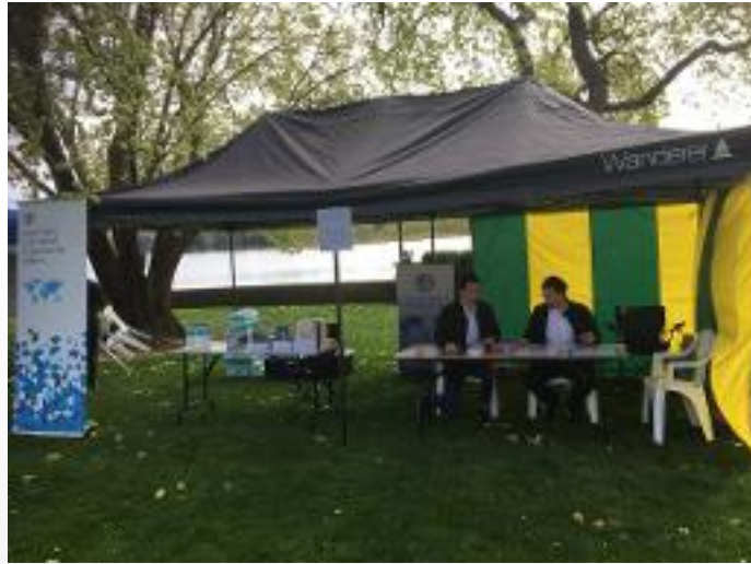
The AIAA held a stall at Government House Open Day, Canberra