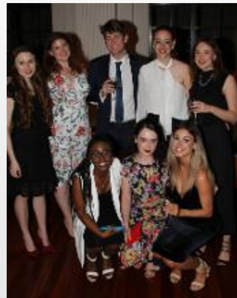
Some of the hardworking AIIA Queensland and AIIA NSW interns in 2017-18