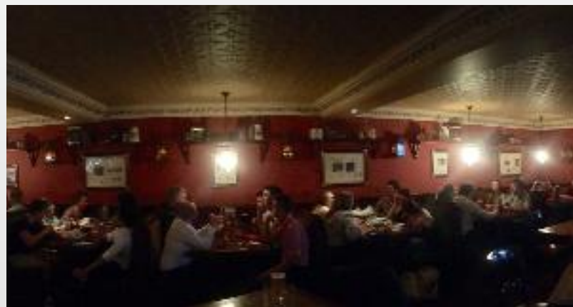
AIIA Queensland Trivia Night, September 2017

Australian Institute of International Affairs