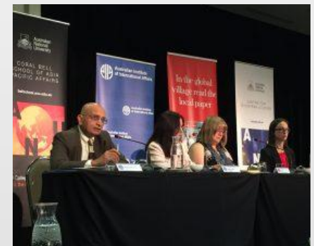
Panel discussing Australia's Contribution to Global Issues