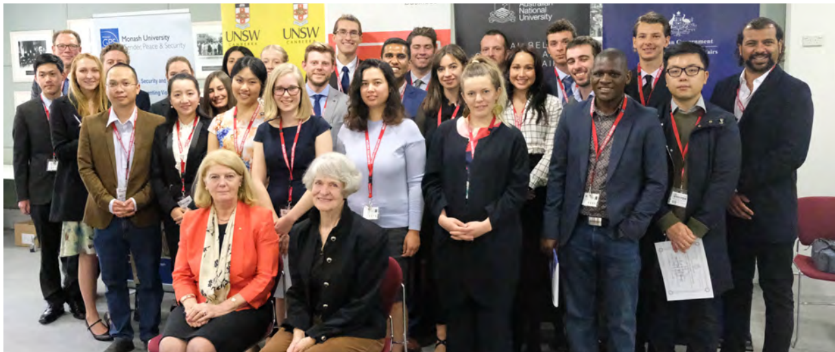
Diplomacy and Public Diplomacy Masterclass Leaders and Attendees