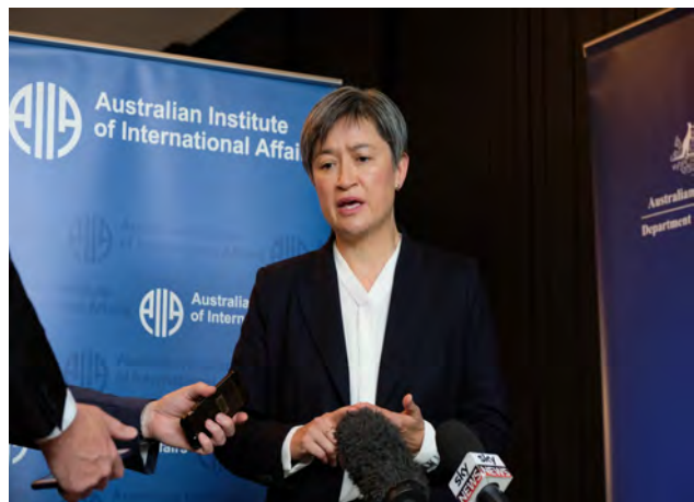
Shadow Minister for Foreign Affairs, Senator 7 the Hon Penny Wong