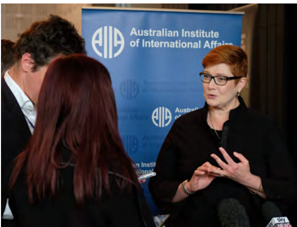
Minister for Foreign Affairs, Senator the Hon Marise Payne