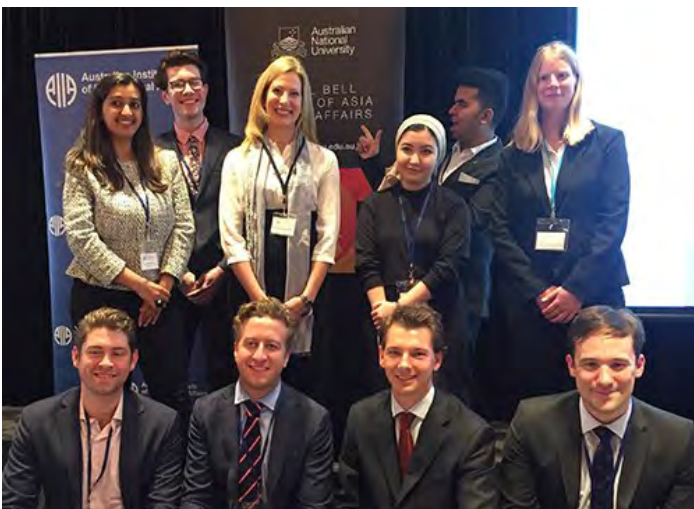
ANU Coral Bell School Attendees