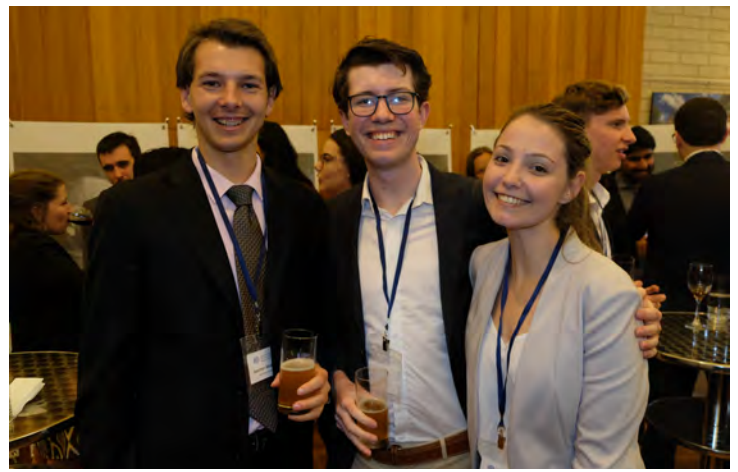
ANU Coral Bell School and New Colombo Plan Alumni Masterclass Attendees