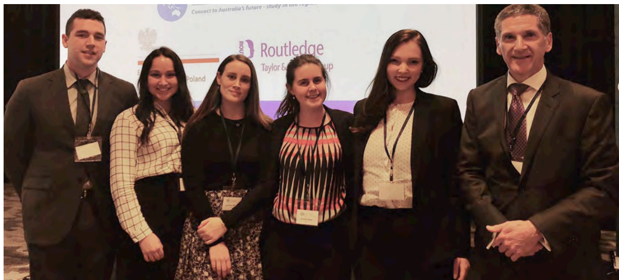
AIIA VIC Office