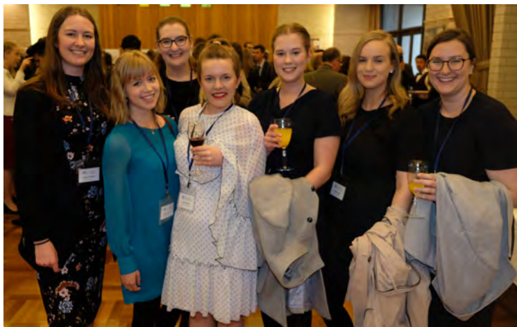
Department of Home Affairs Masterclass Attendees