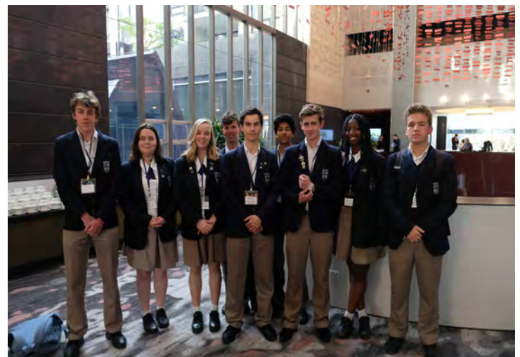
Burgmann Anglican School Attendees