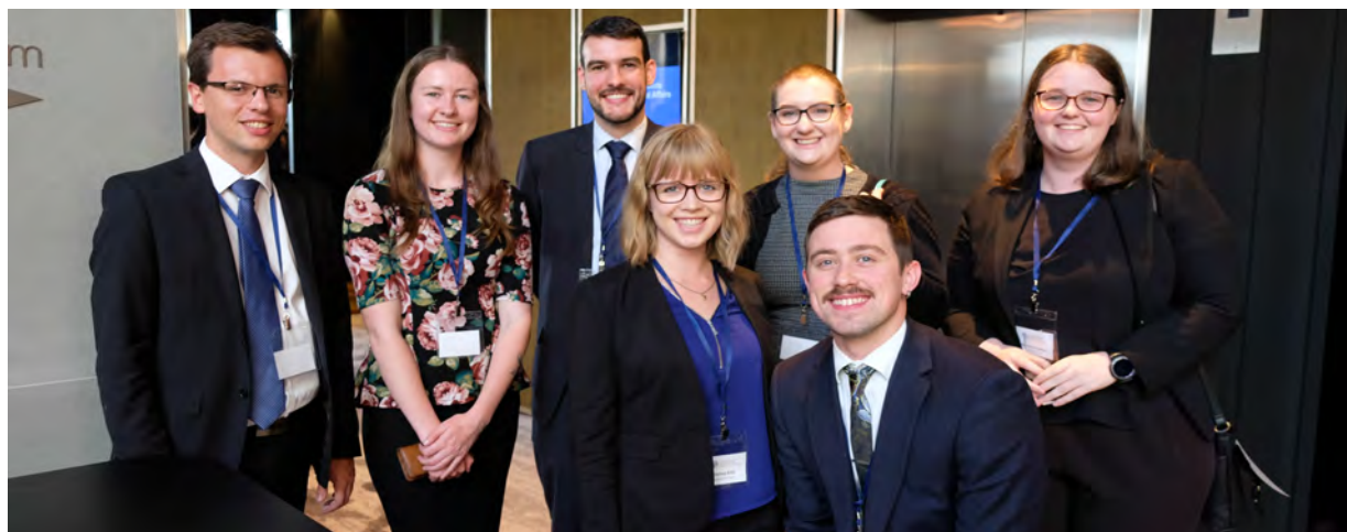
Attendees from Department of Home Affairs