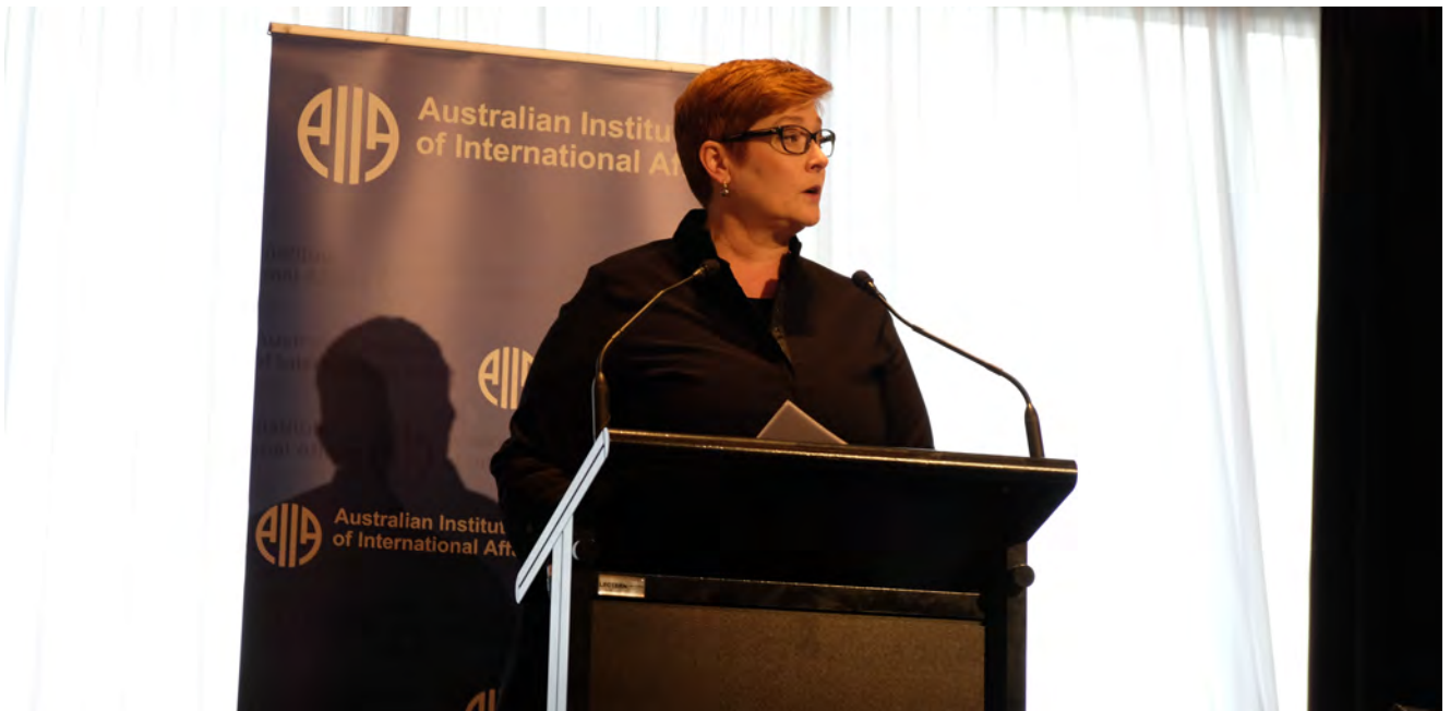
Minister for Foreign Affairs, Senator the Hon Marise Payne