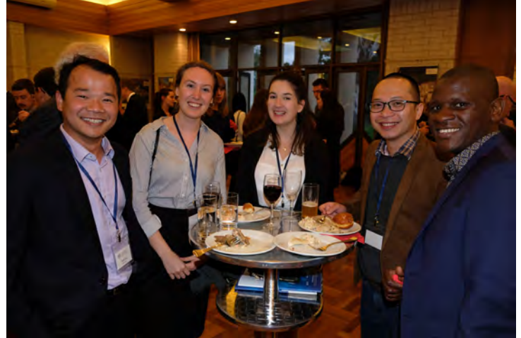
UNSW Canberra and Department of Home Affairs Masterclass Attendees