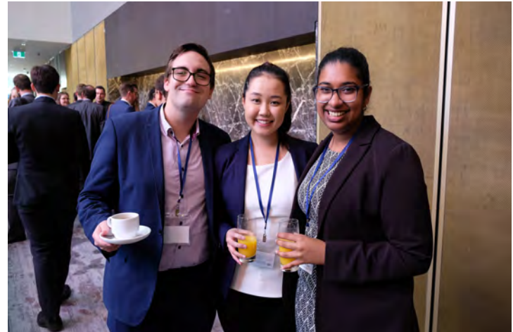
New Colombo Plan Alumni Attendees