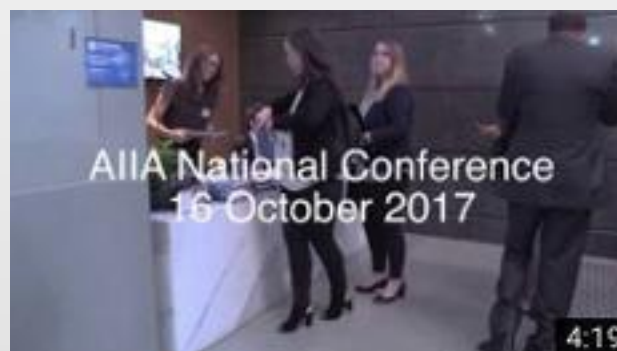
AIIA National Conference 2017 highlights video