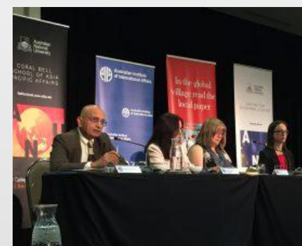
Panel discussing Australia's Contribution to Global Issues