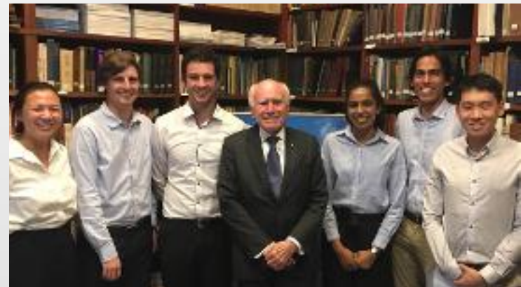
The Hon John Howard OM AC, Former Prime Minister of Australia, spoke to AIIA NSW and met with AIIA NSW interns

Australian Institute of International Affairs