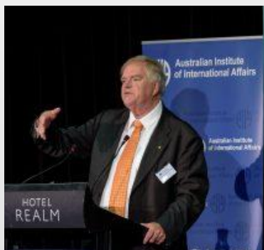
The Hon Kim Beazley AC FAIIA, AIIA National President