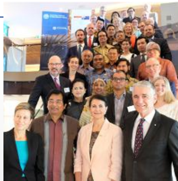
Co-Chairs The Hon John Anderson AO and His Excellency Hamzah Thayeb with Minister for International Development and the Pacific Senator The Hon Concetta Fierravanti-Wells, Senator Jenny McAllister and participants

The Dialogue was organised by the AIIA with support from the Department of Foreign Affairs and Trade, the Indonesian Ministry of Foreign Affairs and PwC Australia.