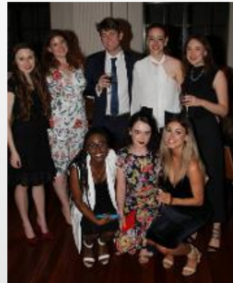
Some of the hardworking AIIA Queensland and AIIA NSW interns in 2017-18