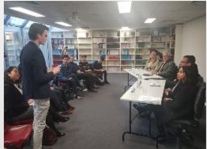
AIAA supported students from the International Alliance of Research Universities at the ANU Global Summer School

Australian Institute of International Affairs