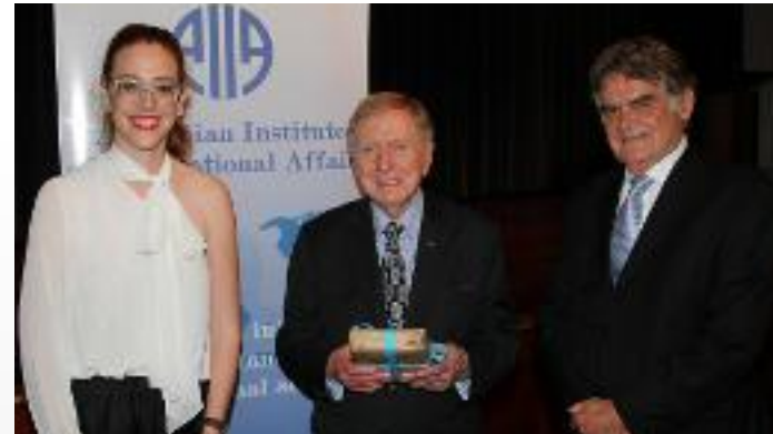
The Hon Michael Kirby AC CMG FAIIA spoke at AIIA Queensland's Annual Dinner in 2017