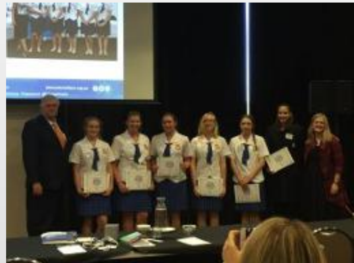
2017 Young Diplomats Program winners from Pimlico State High School.

In 2017 the AIIA continued its long-term partnership with James Cook University to run a diplomacy competition for Year 10 students from the Townsville region in North Queensland. Winners were given the opportunity to attend the AIIA National Conference.