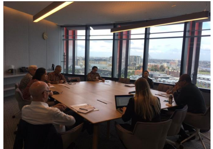
Working Group 1: The Dynamics of Bilateral, Regional and Global Developments