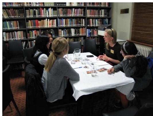
YPF Internship Evening

In September the YPF presented its first-ever Internship Night in conjunction with the Monash International Affairs Society to great success and feedback.