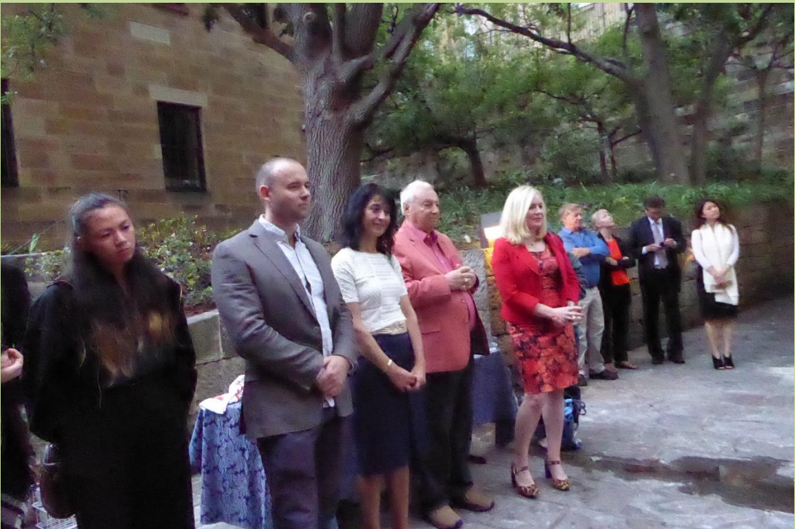
The talk/concert was followed by our annual Christmas buffet from 7.15-8 pm.