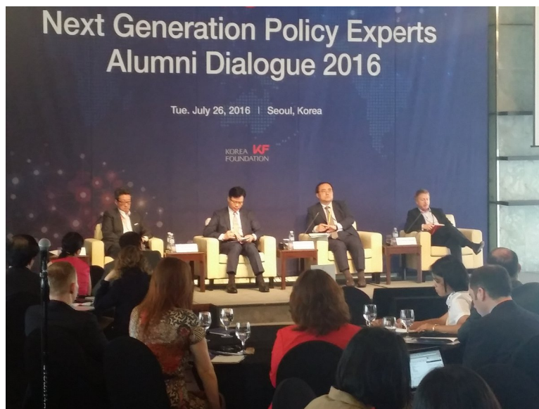
Panelists at the KF Next Generation Policy Experts Alumni Dialogue