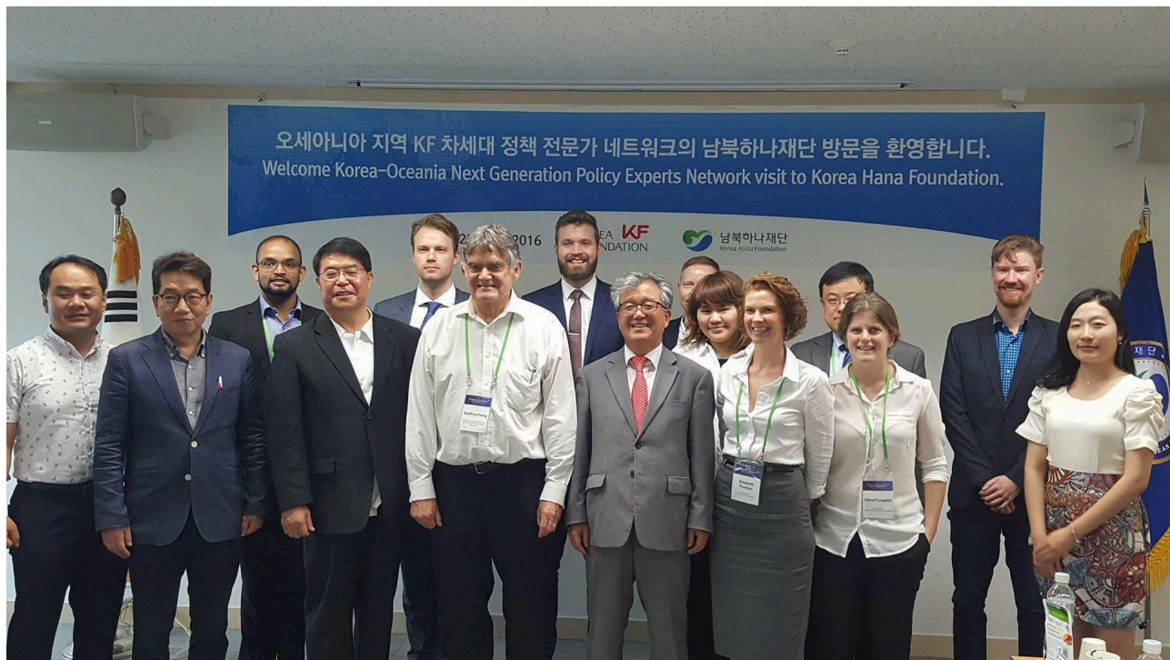
Visit at the Korea Hana Foundation to learn about DPRK refugee integration

At conclusion of the week’s proceedings, participants were given the opportunity to partake in significant historical and cultural activities including a tour of the Demilitarized Zone (DMZ), Unification Bridge, the War Memorial of Korea and Myeong-dong. Participants also departed from Korea over this period.