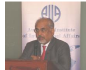
Mr T.N. Ninan Chief Editor of Business Standard India 2020: Will it Achieve its Potential? SA Branch