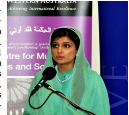
The Hon. Hina Rabbani Khar Pakistani Minister of Foreign Affairs Pakistan's Role in South Asia WA Branch

“History has taught us that islands of growth and development will not emerge out of an ocean of violence and discord. Look at Europe, look at Far East Asia, look at parts of Eastern Europe; their development has only followed, never preceded, peaceful resolution of disputes and a peaceful regional environment.”