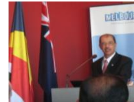
H.E. James A. Michel President of the Seychelles Seychelles Today AIIA VIC

"[The Commonwealth] now constitutes 2.3 billion people, which is one third of humanity, and is an enormously important potential servant of humanity....[It] stands for freedom, independence, justice and all of that, but when it comes to a crunch and a test is presented... the organisation doesn't really walk the walk. It talks the talk but doesn't always walk the walk."