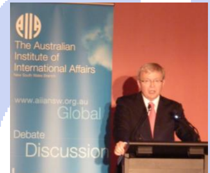
The Hon. Kevin Rudd MP Minister for Foreign Affairs 2011 Sir James Plimsoll Lecture Tasmania Branch

“[We] see Asia emerging now as a dominant global actor in the affairs of the world — no longer the object of foreign policy interests of greater powers from the West, but now itself the “subject,” with a capacity now (for good or for ill) to shape the future of the West itself. Because of proximity, we in Australia begin to understand this implicitly.”