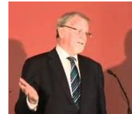
Prof. The Hon. Gareth Evans AC FAIA Former Minister for Foreign Affairs 2012 Charteris Lecture AIIA NSW