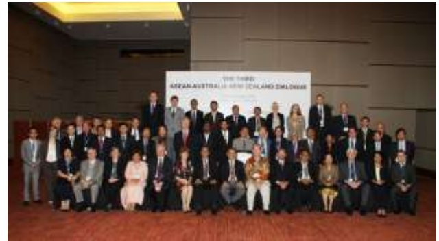
ASEAN Australia New Zealand Dialogue

Asia Pacific College of Diplomacy, ANU Australian National University Deakin University Fletcher School Club in Australia Flinders University Griffith University Innovative Universities EU Centre James Cook University Kathleen Lumley College, Adelaide La Trobe University Ming Chuan University, Taipei Monash University Murdoch University Asia Research Centre Princeton University, New Jersey, USA RMIT Melbourne St Catherine's College, University of WA St George's College, University of WA UWA Centre for Muslim States and Societies University of Adelaide University of Canberra University of Freiburg University of Melbourne University of New South Wales University of Queensland University of Tasmania University of WA