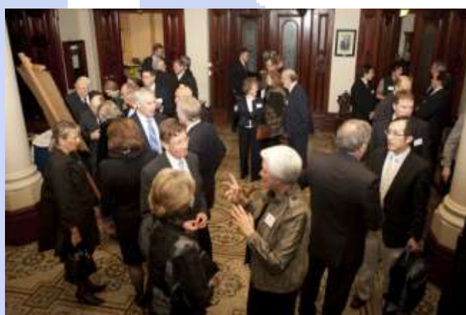
AllAV members at the Sir Zelman Cowen Oration