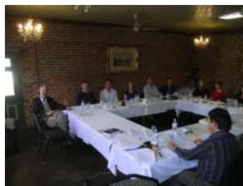
Australia in World Affairs workshop