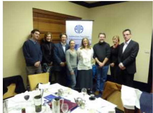
AJIA Editorial Board Meeting, 2011

Editor-in-Chief, Australian Journal of International Affairs