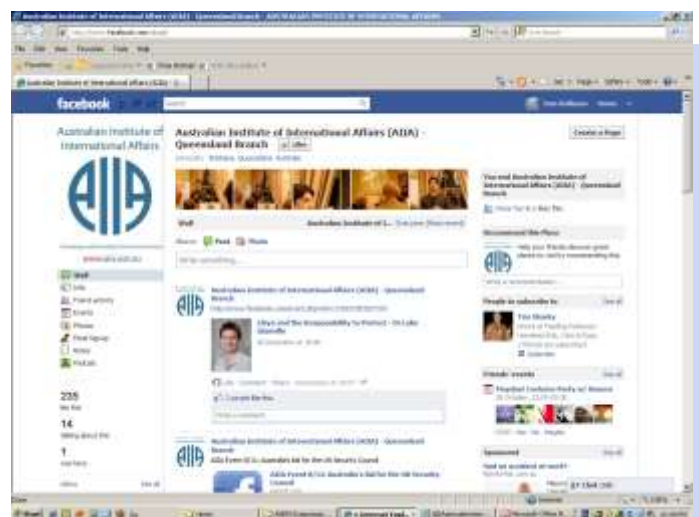
AIIA Queensland Branch's Facebook page