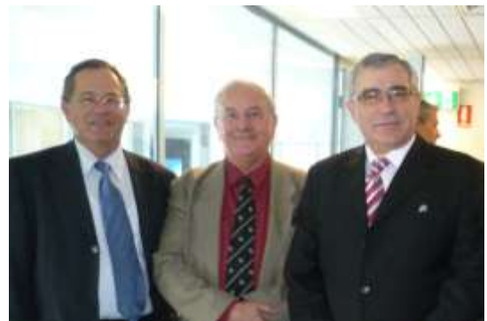
ACT Branch members meet HE Sven Alkalaj, Minister for Foreign Affairs, Bosnia and Herzegovina