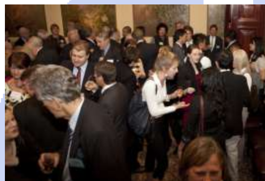
AllAV members at the Sir Zelman Cowen Oration