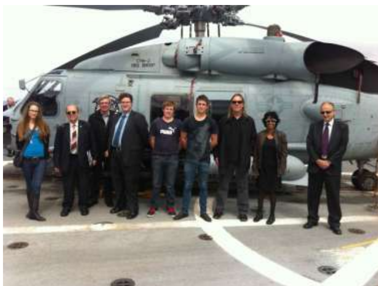
Members of the AIIA TAS Executive with US Consulate staff on board the USS Shoup