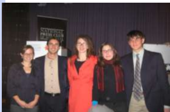
AIIA interns attending the foreign policy election debate at the National Press Club , October 2010

Internships with the AIIA National Office and Branches provide the opportunity to build networks and in some cases credit towards a degree, all while offering invaluable experience working with the international relations community.