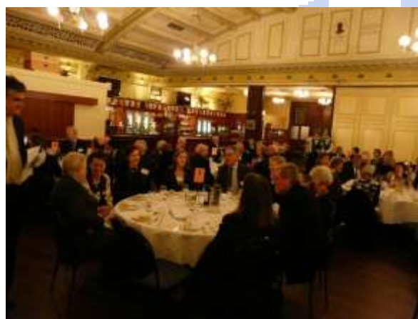
Heindorff Memorial Dinner, 18 August 2010