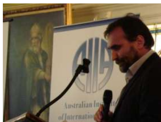
Michael Ware , Former CNN and Time correspondent