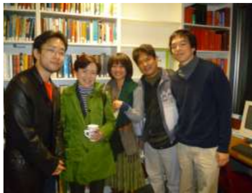
Guests at Japan Leadership Panel, October 2010