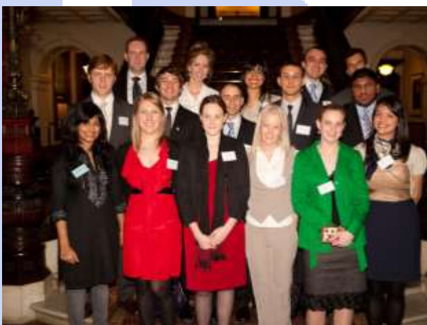
AIIA VIC ACCESS members

ACCESS distributes two publications: Monthly Access and Quarterly Access . The AIIA thanks DFAT State Office and Roy Morgan Research for their generous grant support in establishing these publications.