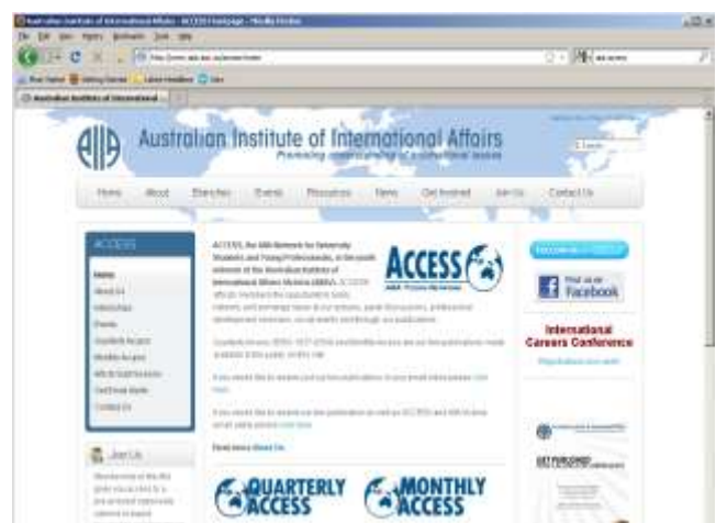
AIIA VIC ACCESS Webpage

Online distribution is used for a number of AIIA publications, especially youth publications such as Quarterly ACCESS and Monthly ACCESS .