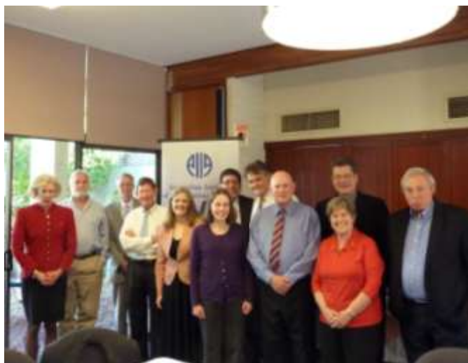
AIIA National Executive, 2011

PO Box 1326 South Perth WA 6951 Email: wa.branch@aiia.asn.au