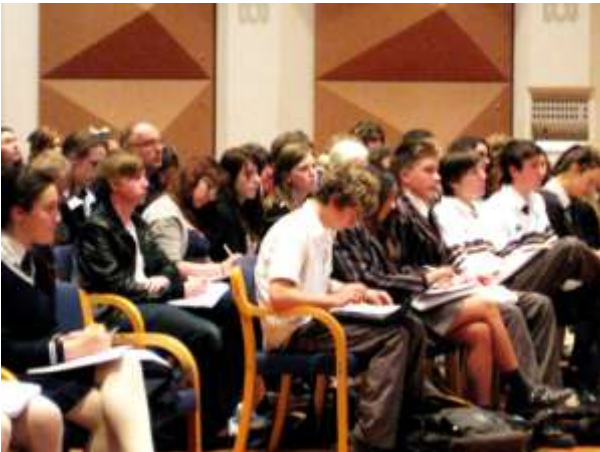
AIIAV VCE Seminar at the ABC Iwaki Auditorium

AIIA VIC continued to run its successful seminar series including sessions on 'Power and National Interest', 'Conflict and Internationalism' and 'Australian Foreign Policy and Power in the Asia Pacific'. These sessions are designed to assist students studying the Victorian Certificate of Education subject International Studies and are very well attended. The high calibre of speakers provides students with real insight into international issues.