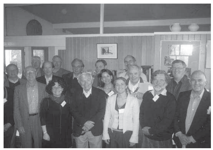
Participants at 'Australia as a Middle Power' Colloquium, Manning Clark House, 8 September 2007

The AIIA offers a number of ways to get involved including membership, events, publishing, youth networks, education programs, donation and volunteering. For more information please visit <a href="https://www.aiia.asn.au.">www.aiia.asn.au.</a>