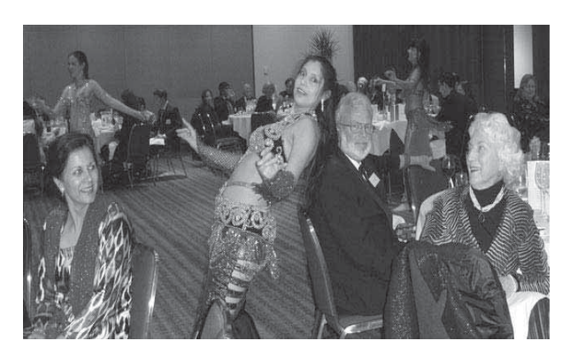
Post-Fulbright Symposium Celebrations