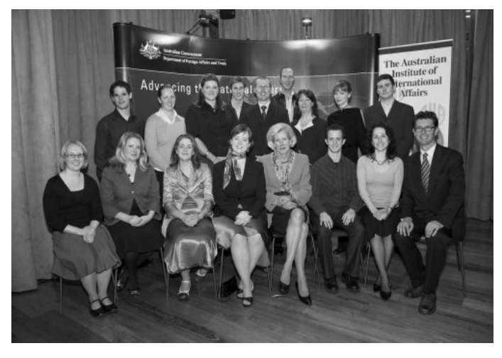
ACCESS Victoria launch