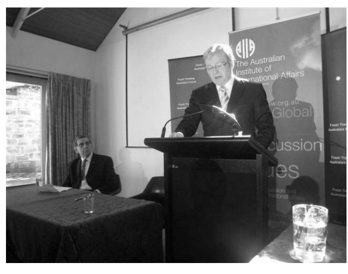
Former Shadow Foreign Affairs Minister, the Hon Kevin Rudd, MP

The Canberra Branch has enjoyed another successful year. Taking full advantage of our location in the National Capital we had speakers for 25 meetings, including a number from the Diplomatic Corps.