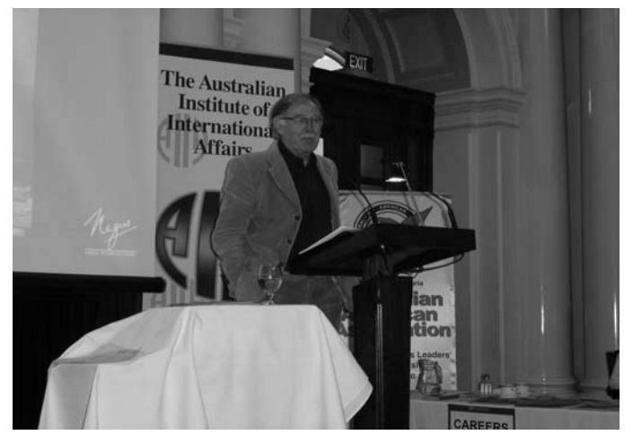
George Negus at the AIIA VIC International Careers Conference 2006

The AIIA seeks to educate the community on international issues through a range of projects.