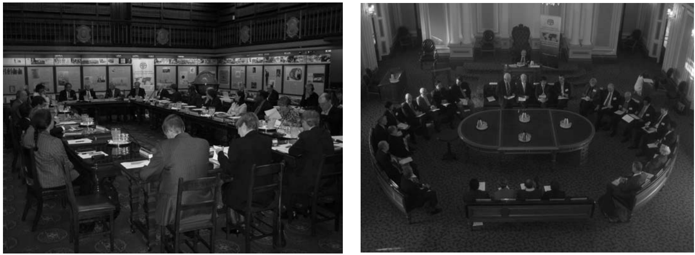
National President's Forums held at NSW Parliament and Queensland Parliament in 2006 and 2007

The Australian Institute of International Affairs provides a forum for debate by arranging lectures, seminars, and workshops for its members. In providing a forum for debate the AIIA does not promote a particular view. The views expressed are the personal views of the speakers which form the basis for informed debate. AIIA events range from intimate discussions to large lectures. Branches each organise their own programs on chosen topics of current interest. The National Office assists in organising speakers to visit several Branches, referring speakers to