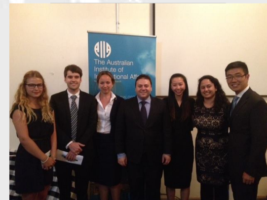
NSW Intern Evenings event