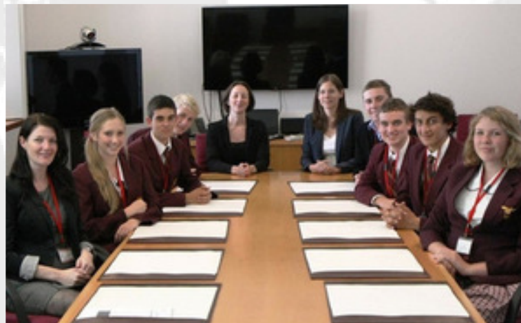
Winners of the Young Diplomats Program at the United Kingdom High Commission in Canberra