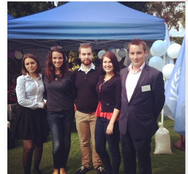
AIIA QLD Young Professionals event

AIIA NSW also held a Youth Event Series launch on Women in War Zones.