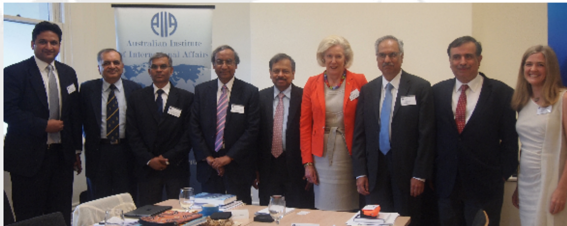
Indian and Australian Delegations, Australia India Institute, 2014

The Australian Institute of International Affairs along with the Australia India Institute hosted a roundtable dialogue with a visiting delegation from the Indian Council of World Affairs. The roundtable was held in Melbourne at the Australia India Institute on 18 March 2014. The dialogue aimed to promote greater understanding and cooperation between Australia and India by bringing together delegations made up of academics, policymakers, media and practitioners to develop new frameworks to enhance cooperation and collaboration on various forums.