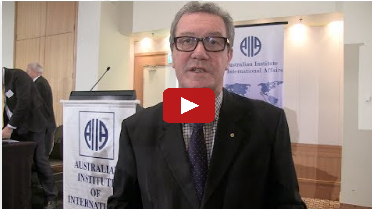
AIIA 80th Anniversary National Conference Highlights

In 2013 the AIIA celebrated its 80th Anniversary as a national organisation promoting public debate on international issues. Following the September Federal Election the AIIA held a National Conference in Canberra on the topic of "Foreign Policy Priorities for Australia". The conference aimed to bring together Australian experts in the field of security, economics and global issues and to identify realistic objectives and goals for Australia's foreign policy.