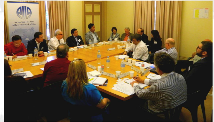
International Confucian Association Roundtable in Brisbane

The AIIA, along with the University of New South Wales in Sydney and Deakin University in Melbourne, hosted a series of roundtables with a visiting delegation of experts from China, Singapore and Vietnam organised by the Beijing-based International Confucian Association. The roundtables took place in Brisbane, Sydney and Melbourne from 2 – 8 September 2013.