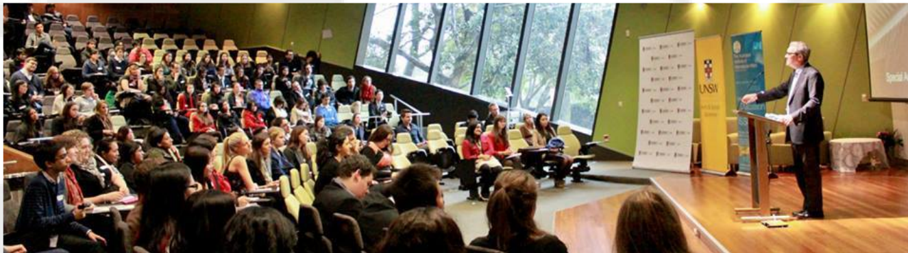
UN Special Representative to the Secretary-General for Cyprus, The Hon. Alexander Downer AC, addressing the University Diplomacy Conference co-hosted by AIIA and UNSW