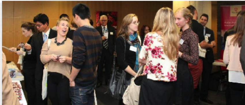
Careers Without Borders event, WA

Careers Without Borders and Developing Young Scholars WA: The Young Professionals Network of AIIA WA Branch organised the well-attended annual "Careers without Borders" event that included several practitioners and networking organizations, and a "Developing Young Scholars" event for students contemplating honours and postgraduate work. The "Young Superstars of WA" spoke on 29 October 2013. The YPN Convenor also successfully negotiated with American Chamber of Commerce and Committee for the Economic Development of Australia to provide special member access to their public meetings with international relevance.